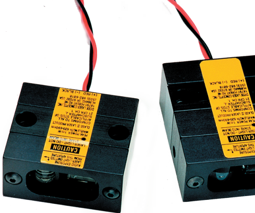
Standard Cross Hair

From DLC, the reliability leader of diode laser module manufacturers